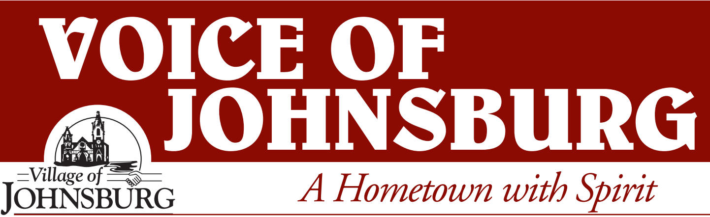
Settled 1841 – Incorporated 1956