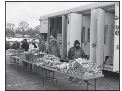
Johnsburg Rescue Squad Retired