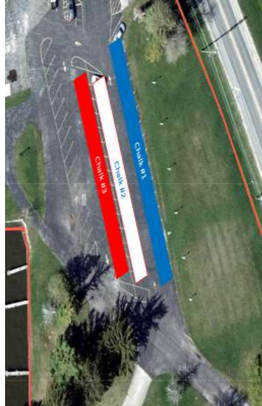
Off-Site & Special Guest